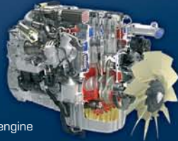
DC9 5 cylinder engine